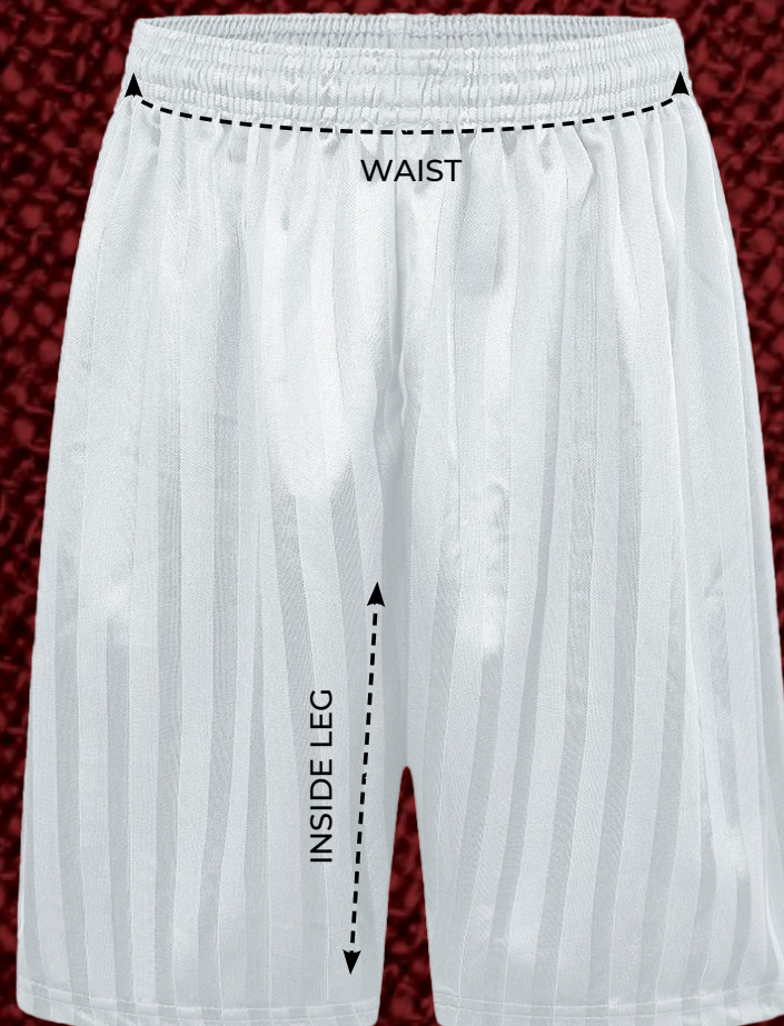
P.E. STRIPE SHORTS