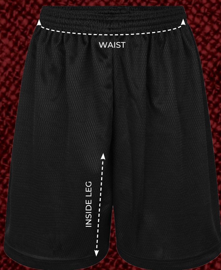
P.E. MESH SHORTS

When measuring make sure you are stood up straight. Measure from the top of the inside leg at the crotch down to where you want the shorts to finish – usually 1" above the knee.