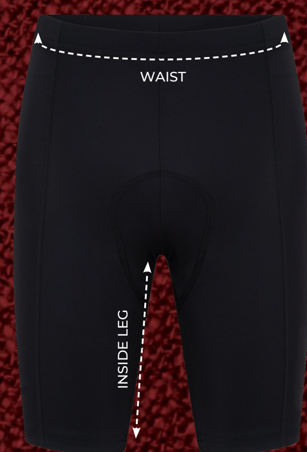
P.E. CYCLING SHORTS

THESE CHARTS ARE TO BE USED AS GUIDES ONLY. NOT ALL STYLES ARE AVAILABLE IN THESE SIZES - FOR MORE INFORMATION CHECK WEBSITE.